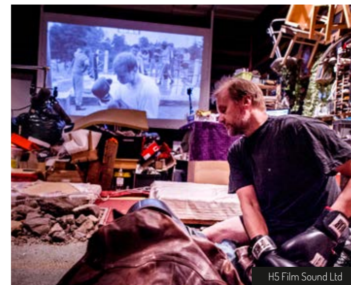
H5 Film Sound Ltd